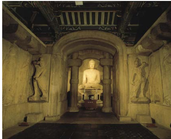
Figure 3 Sökkuram Grotto, near Pulguksa temple The two Kūmgang yōksa statues are located next to the right and left of the arch.